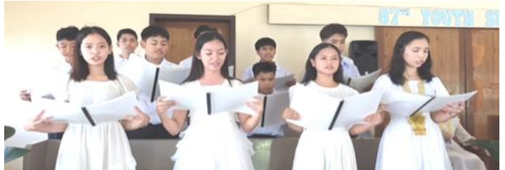
The Balogo Branch Church Youth Choir.