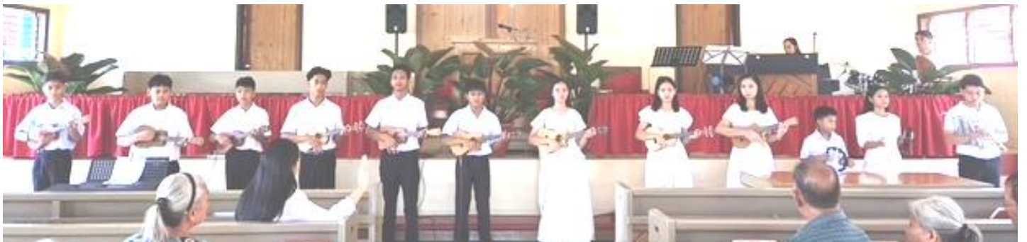
The Balogo Branch Church Youth Orchestra.