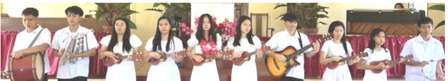
The President Roxas Branch Church Youth Orchestra.